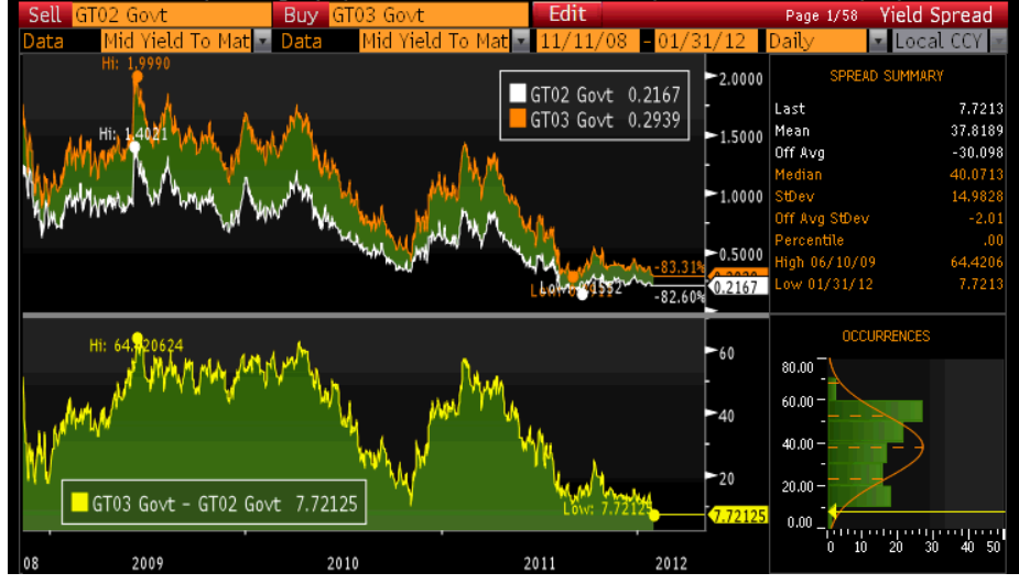
Figure 2: Yield Spread Between 2-3 Year Treasuries Reaches

The easy money is gone in "risk-free" assets. The two-year note is yielding a paltry 22 basis points, and the three-year note does not look much more attractive at 29 basis points. The spread between two- and three-year Treasuries (as seen in Figure 2) has reached a relative low of 8 basis points as of January 31<sup>st</sup> – the lowest level since the reintroduction of the three-year in November 2008. One year ago, these notes were yielding 56 and 96 basis points, respectively.