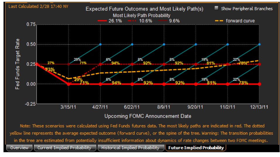
Figure 5: Fed Funds Indicate that the FOMC Will Remain on Hold throughout 2011