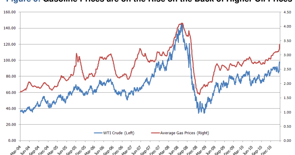
Figure 3: Gasoline Prices are on the Rise on the Back of Higher Oil Prices

In the same report, Deutsche Bank also forecasts that the same $10 rise in oil prices will lead to a 25 cent per gallon increase in retail gas prices. According to the Daily Fuel Gauge Report put out by AAA, national retail gas prices now average $3.387 per gallon, and this is before the peak driving season beginning Memorial Day weekend. The all-time high for retail gas prices was reached July 17<sup>th</sup> 2008 at $4.11 when WTI crude was $145 a barrel (oil is currently trading at $104).