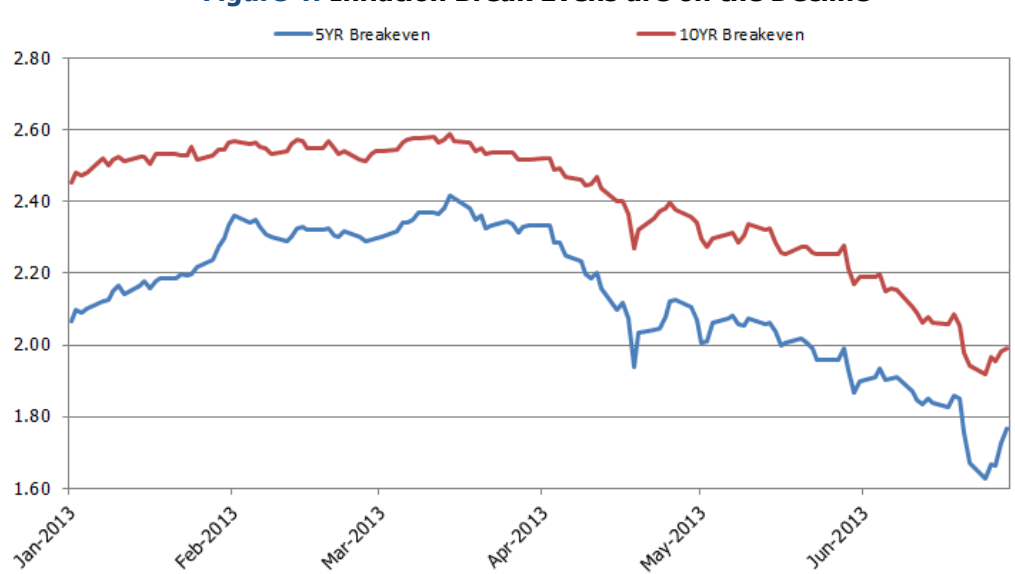
Figure 4: Inflation Break Evens are on the Decline

Core CPI has been on a steady decline the past two years, and core PCE, the indicator that the Fed monitors closely, stands at only 1.1%. Inflation expectations have collapsed in recent months with five- and ten-year inflation break evens—the average inflation rate implied by comparing Treasury TIPS to nominal bonds over a given timeframe—declining 72 and 62 basis points respectively over the past quarter alone. Several Fed officials have indicated that this trend, while subject to a number of transitory factors, is worrisome.