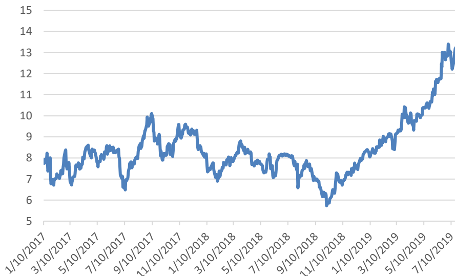
Figure 3: Global Negative Yielding Debt ($, tn)

The global shift to accommodative policy has driven negative yielding debt levels to a record high (see Figure 3). For context, 85% of German sovereign debt and the entire Swiss sovereign yield curve is negative yielding upending traditional fixed income analysis. Additionally, some $2 trillion in corporate bonds have sub-zero yields. This dynamic continues to be supportive for debt issuers and will drag on U.S. Treasury yields even as borrowing to fund large deficits tops $1 trillion annually.